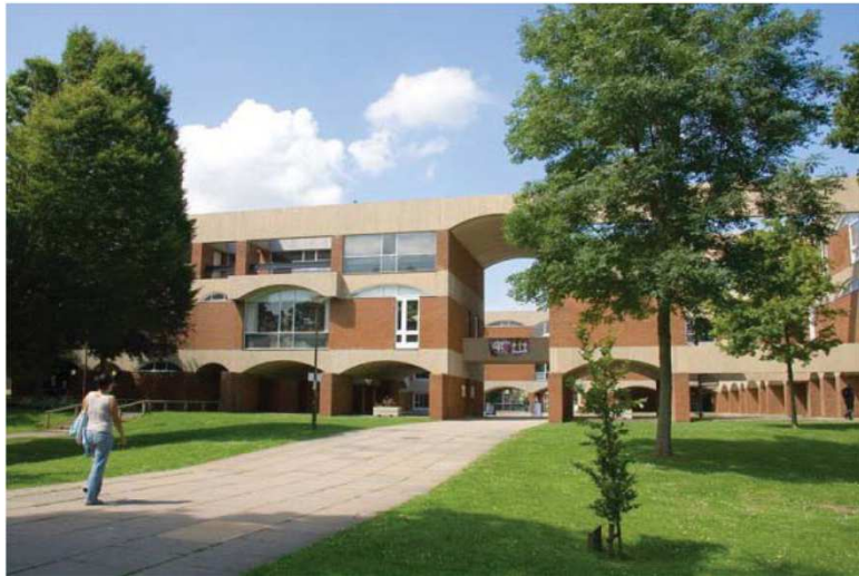
Falmer House, the Grade I listed Spence centrepiece building