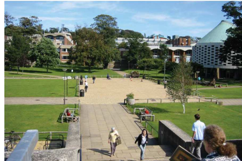
Fulton Court, the heart of Spence's academic group of listed buildings